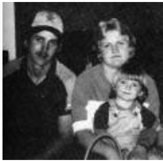
A picture from their first years at the Ranch.