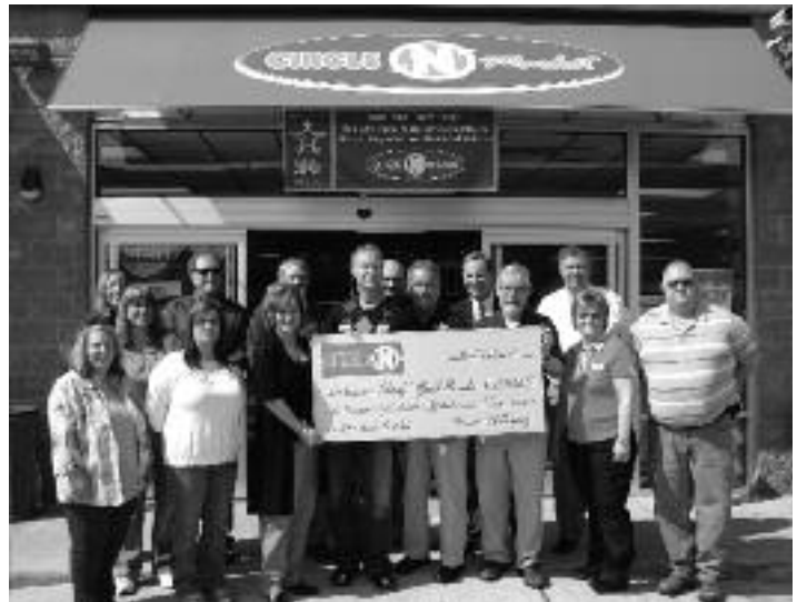
Customers, vendors join in giving during Open Hearts, Pump Up 2011