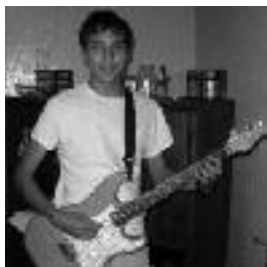
Faith Hall Page 6

...includes new features to keep supporters connected with life on the Ranch