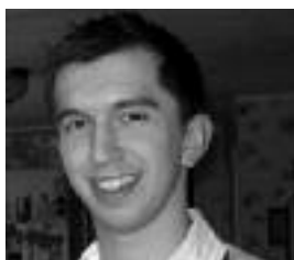
Independent Living Page 7

Throughout the past 35 years, the Ranch has introduced many resources to share its successes with those who make them possible. That capability greatly expanded in June with the launch of the new YouthRanches.com, a redesigned website using the latest in communications tools to provide an inside look at daily life on the Ranch and keep supporters more connected than ever before.