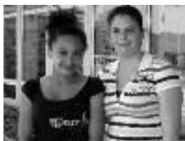
Olds Cottage Page 7