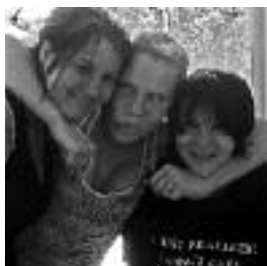
Gratton Hall Page 7