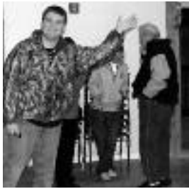
Faith Hall Page 6