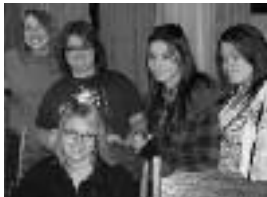
Gratton Hall Page 7