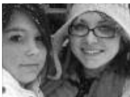
Olds Cottage Page 8

Founded in 1976 as the Arkansas Sheriffs' Boys Ranch, Inc. to provide: "Exclusively charitable, educational, and the prevention of cruelty to boys, by providing a home, ranch, and training school for underprivileged boys." The organization was created to provide a non-governmental residential childcare program for children from all 75 counties in Arkansas.