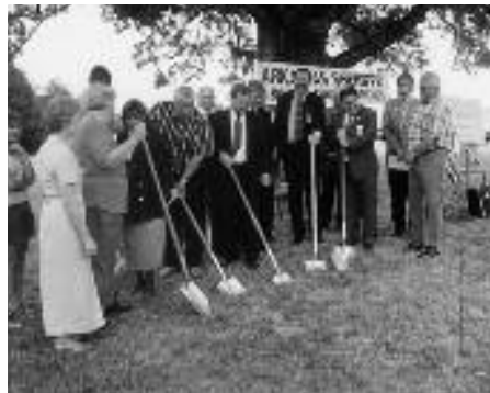
Groundbreaking on the office

A search committee was formed to locate a suitable piece of property on which to establish the first campus. After considering "seven or eight pieces of property," the committee chose a 528-acre site on the White River near Batesville (Independence County). The corporate headquarters was moved to Batesville in 1977. Two young boys