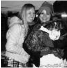
Cabe Hall Page 6